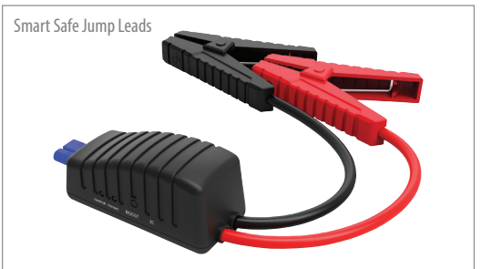
Smart Safe Jump Leads